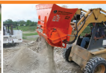
Powerful Hog Crusher pulverizes debris in minutes.