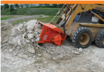
Scoop up recyclable material.