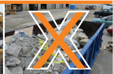
Stop paying to have recyclable debris removed from job site.