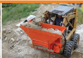
Level Hog Crusher and start recycle process.